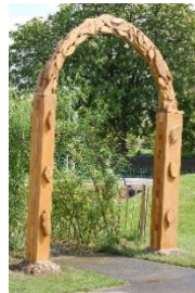
D. Gateway to Louie Memorial playing field £5k