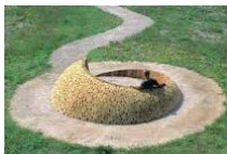
A. Seating (beyond just benches) £11K for 2 areas