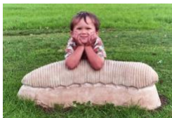
B. Interactive artwork that could be used as play £8K