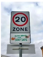
C. Street signage to help calm traffic £1k